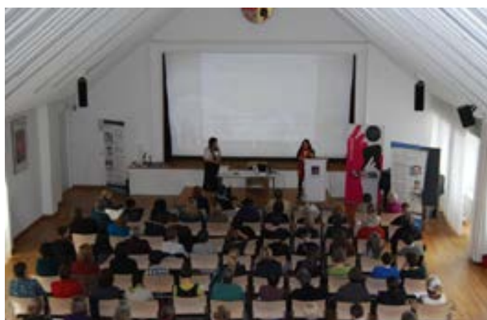
Figure 8. 2016 INWES Regional Conference in Freising, Germany