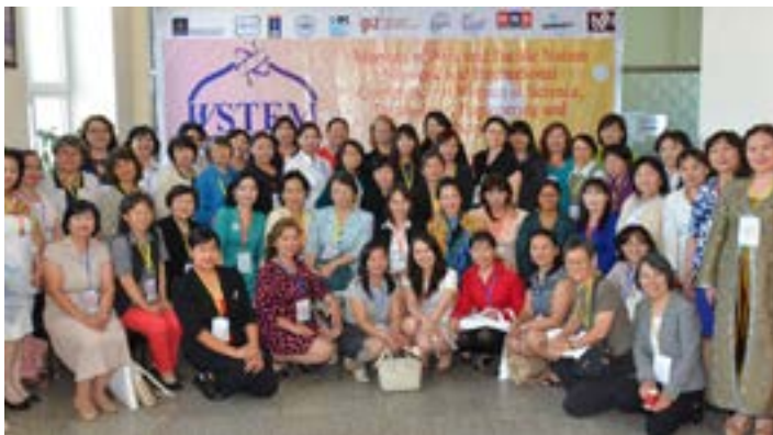
2015 INWES APNN Meeting July 30, 2015, Ulaanbaatar, Mongolia