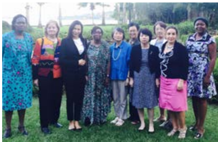
Figure 7. 2015 INWES Regional Conference in Kampala, Uganda

The next Regional conference was held in Freising, Germany in November, 2016, hosted by the German Association of Women Engineers (Deutscher Ingenieurinnenbund, DIB) in commemoration of the 30th anniversary of the founding of DIB. The theme of the conference was “Science. Knowledge. Power.” Over 150 participants from more than 14 countries attended at keynotes, panel discussion, and workshop dealing with current issues like big data, gender and science, technology and career perspectives (Figure 8). The travel awards from UNESCO were awarded to support travel of some of the participants from overseas.