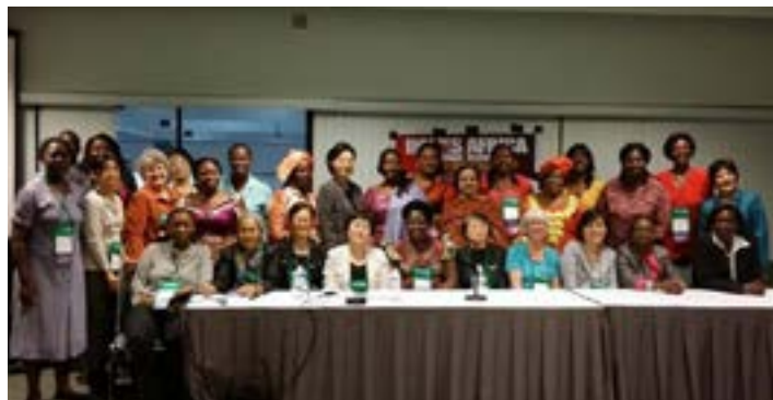
Figure 10. 2014 INWES ARN inaugural Meeting in Los Angeles, USA