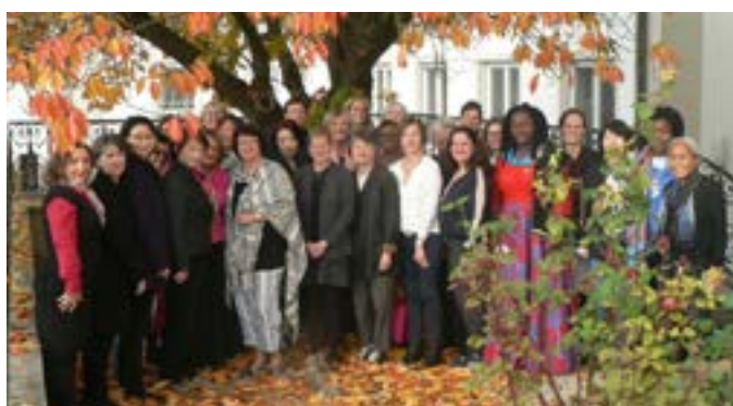
BM 21 - Nov. 2-3, 2016, Conference, Freising, Germany