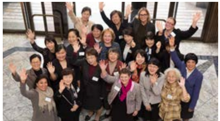
2016 INWES APNN Meeting Aug. 18, 2016, Wellington, New Zealand