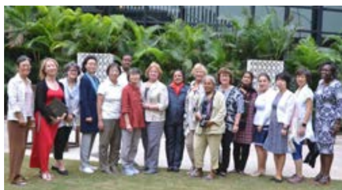
BM 23 - Oct. 4, 2017 in ICWES17, New Delhi, India