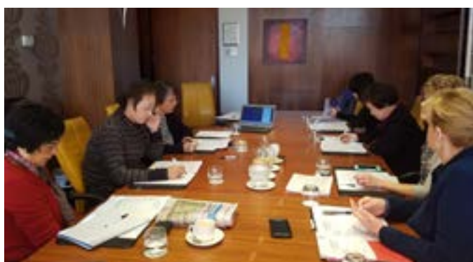
Directors' Discussion - Aug. 20, 2016, Wellington, NZ