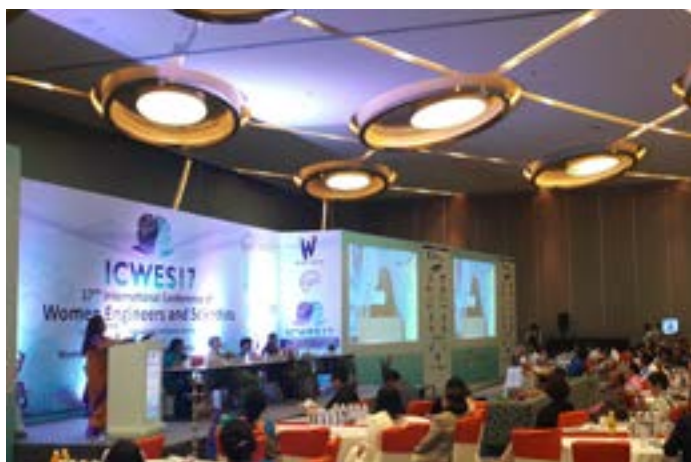
Figure 5. ICWES17 and Chronicles of ICWES