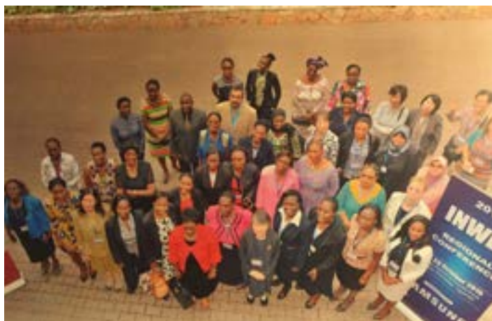
Figure 6. 2015 INWES Regional Conference in Kampala, Uganda

The 2015 regional conference was held in October in Kampala, Uganda, hosted by the African Women Scientists and Engineers (AWSE) and African Regional Network (ARN). The decision was made after applications have been reviewed by the board of directors. The theme of the 2015 conference was “Women in Science, Technology and Innovation for Sustainable Economic and Social Development”. About 50 delegates from 17 countries attended and 93 abstracts were presented. The travel awards from UNESCO and financial support of Samsung were quite helpful in making the meeting a success (Figure 6 & 7).