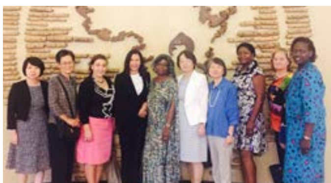
BM19 - Oct. 20, 2015, Kampala, Uganda