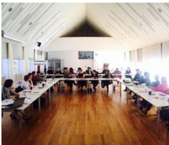
Figure 11. Constitutional Meeting of INWES Europe in 2016, Freising, Germany