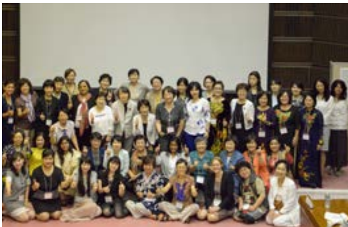
2017 INWES APNN Meeting July 14, 2017, Yokohama, Japan