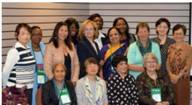
BM18 - Oct. 25, 2014, Los Angeles, Calif., USA