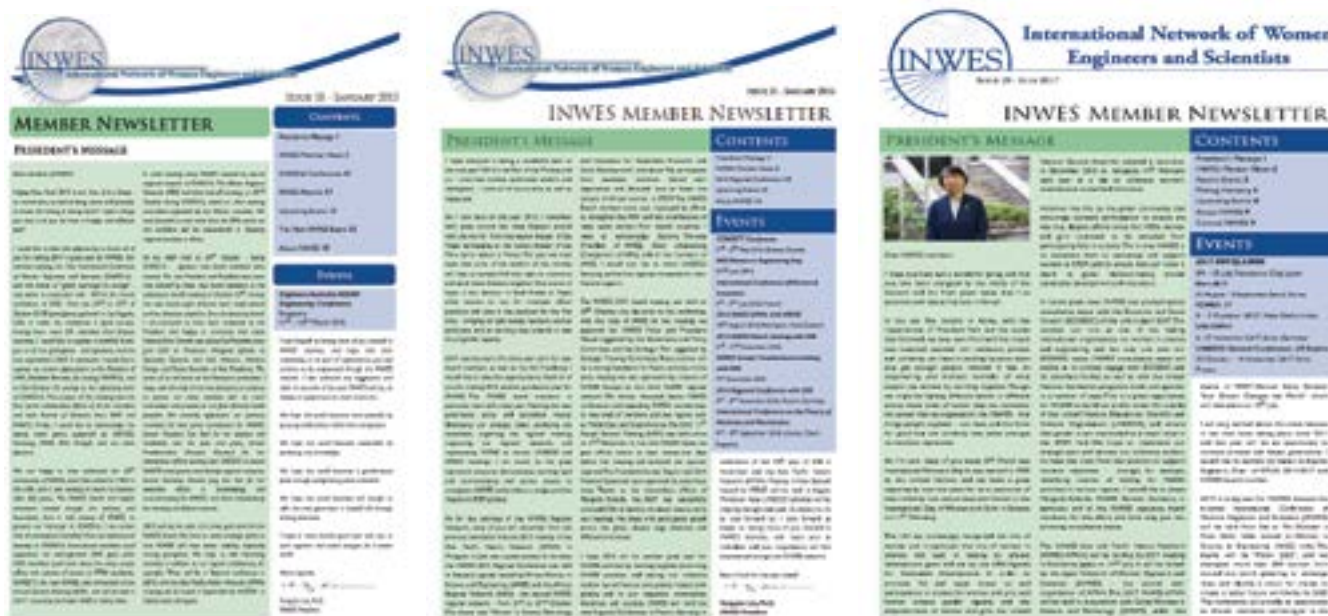
Figure 12. Published INWES Newsletters for 2015-2017