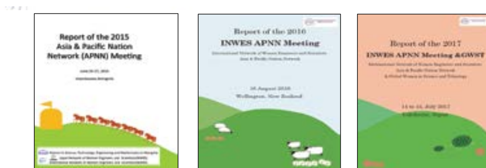
Figure 9. Annual Meetings and Country Reports of INWES APNN

Since 2011, INWES has established regional networks that organise meetings in specific regions. The first regional network that has been initiated is the APNN, the Asia and Pacific Nation Network. INWES members in the Asia and Pacific region are automatic members of the APNN and currently consists of members in Australia, Bangladesh,