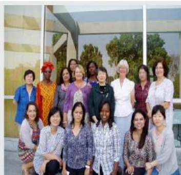
Board members and Guests at BM15 in New Delhi, India

• BM15, October 14-15, 2012, in New Delhi, India, hosted by WISE-India