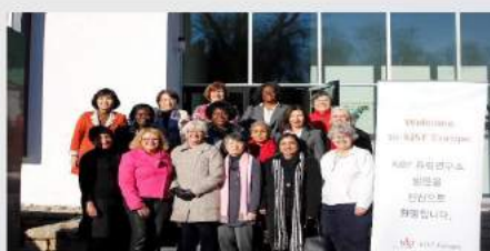
Board members and Guests at BM16 in Saarland, Germany