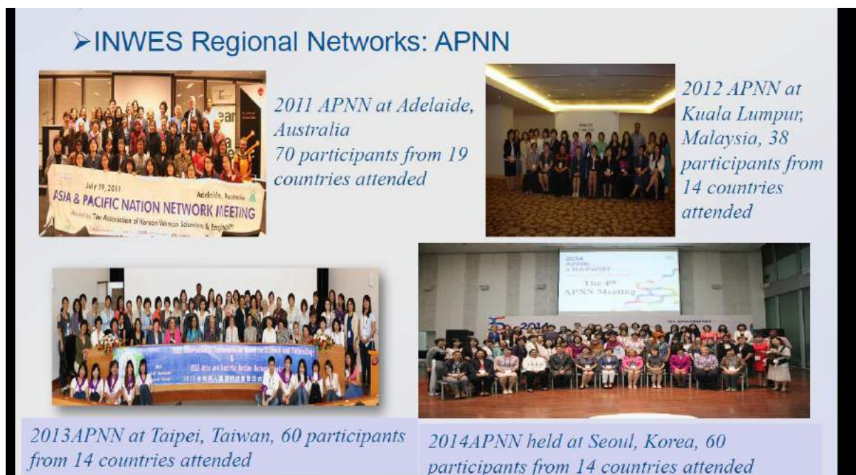
Figure 8. Annual Meetings of INWES Regional Network APNN

in June. The following photograph shows the highlights of APNN to date (Figure 8).