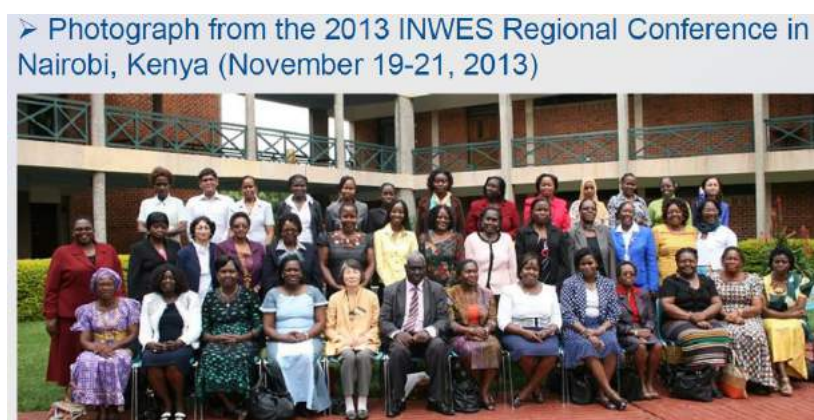
Figure 7. 2013 INWES Regional Conference in Nairobi, Kenya

travel advisories in various countries had hindered the travel of some of our members. However, despite all this, the meeting went very well, where in-depth discussions and information sharing went on. The travel awards from UNESCO and financial support of Samsung were quite helpful in making the meeting a success (Figure 7).