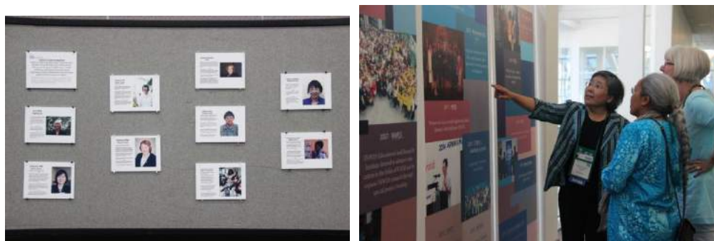
Figure 3. INWES half centennial herstory presented at ICWES16

The next ICWES will be hosted by WISE-India in 2017 and venue decided as New Delhi, India. The decision was made after a call had been announced and applications reviewed, approved by the board of directors and by members at the AGM10. We look forward to seeing many of our members in New Delhi, India then. The following is lists the past ICWES venues and year it was held (Figure 4).