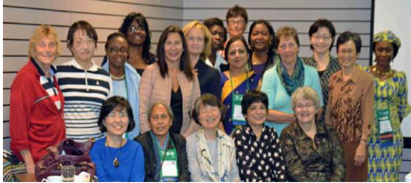
BM17 (Oct 21/22, 2014) at ICWES16, Los Angeles, USA