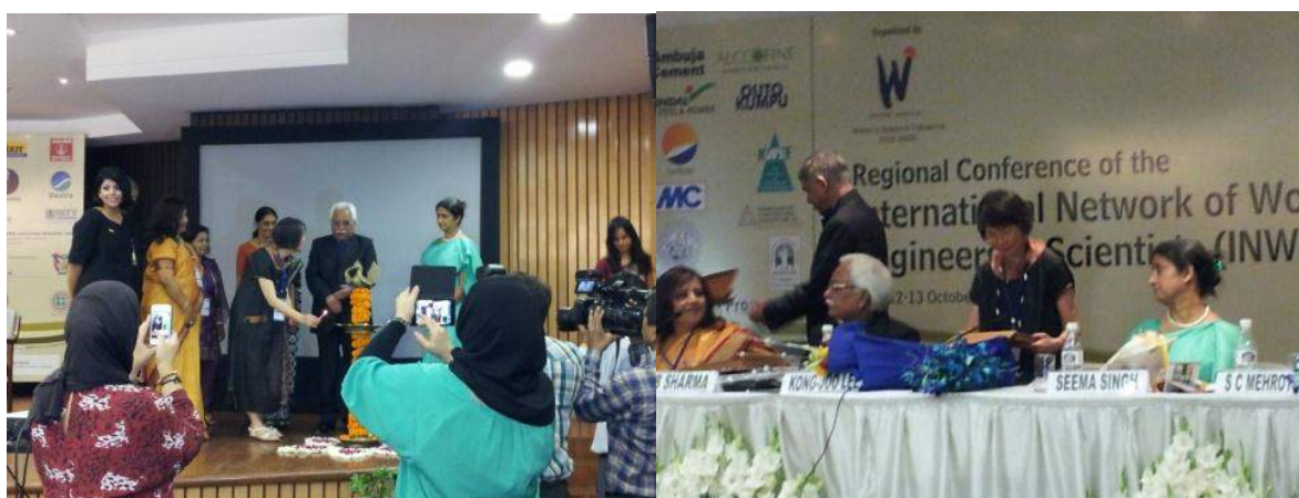
Figure 6. 2012 INWES Regional Conference in New Delhi, India

The 2012 regional conference was held in October in New Delhi, India, hosted by WISE-India. The decision was made after applications have been reviewed. The theme of the 2012 conference was “Women in Science, Engineering, Architecture, Technology and Consultancy” and “Green Infrastructure and Projects.” About 200 delegates from 20 countries attended where 40 technical papers and 30 posters were presented in 9 technical sessions and a poster session (Figure 6).